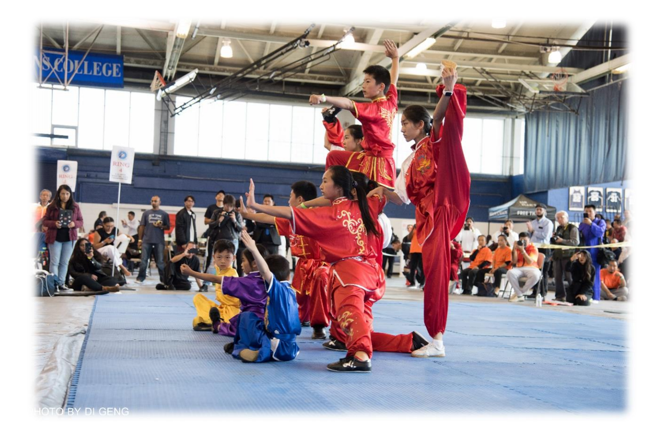
The U.S. Open Martial Arts Championship provides an opportunity for martial arts practitioners of all ages and abilities to come together and show their martial arts skills in healthy and fair

Every year, the World Open Martial Arts Championship (WOMAC) attracts hundreds of elite level national and international competitors. They gather here in Boston to compete for medals and cash prizes, with diverse divisions in Kung Fu, Karate, Taekwondo, Wushu, Tai Chi, Silat, Weapons, Sparring, Judo, and Chinese Wrestling. Organized by the World Fighting Martial Arts Federation (WFMAF), a nonprofit organization established in 2009, the U.S. Open Martial Arts Championship is one of the premier martial arts competition events in the East Coast of the United States. This is the 14th year of our tournament, which will be held on October 26th at Reggie Lewis Track & Athletic Center, at Roxbury Community College in Boston.